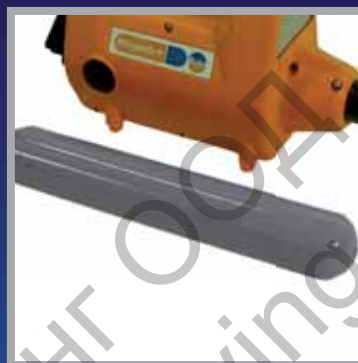
Various Heads To Suit Application