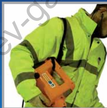
Carry Strap For Easy Handling