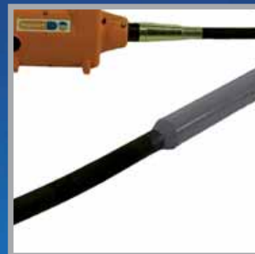
Double Insulated For Electrical Safety

Note: For Complete system the following parts are required: Drive unit/Flexible Shaft/Poker Head