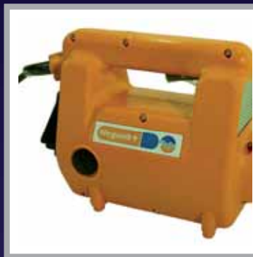
Light Weight And Compact