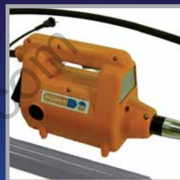
High Frequency Vibration